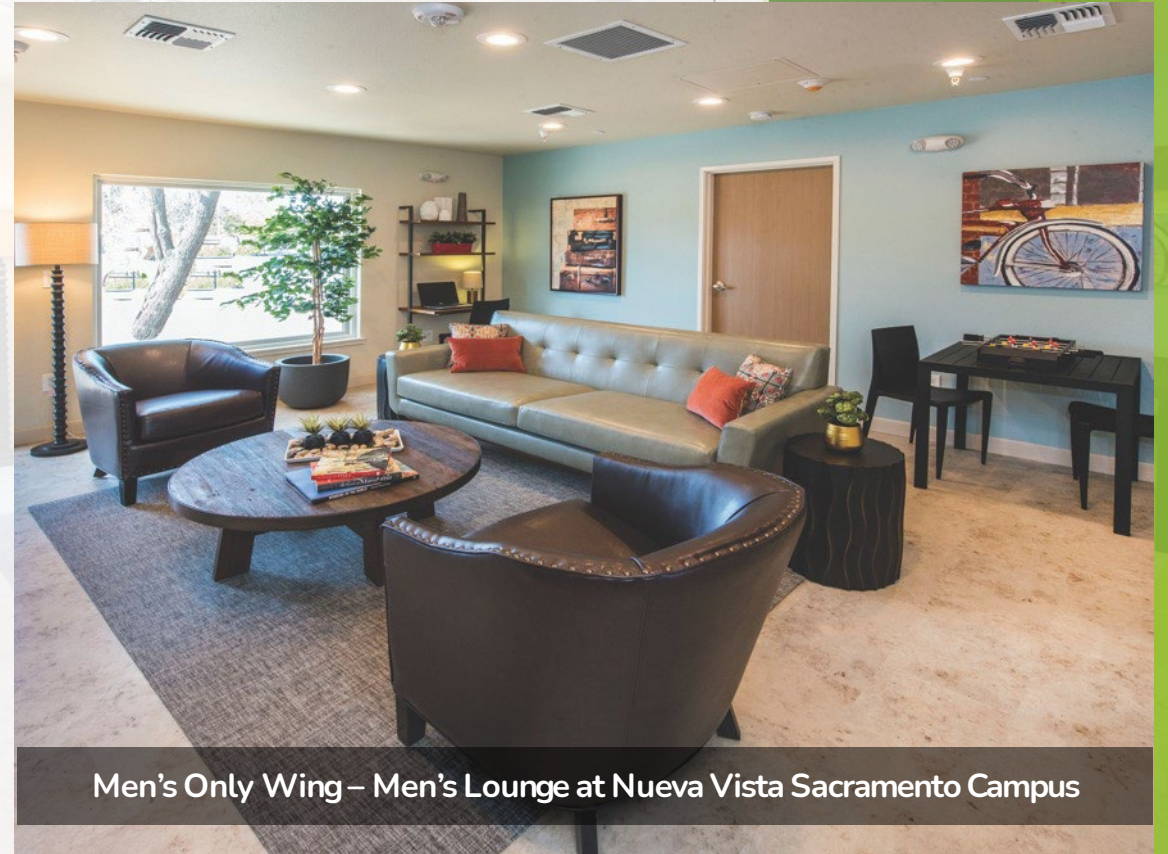
Men's Only Wing – Men's Lounge at Nueva Vista Sacramento Campus