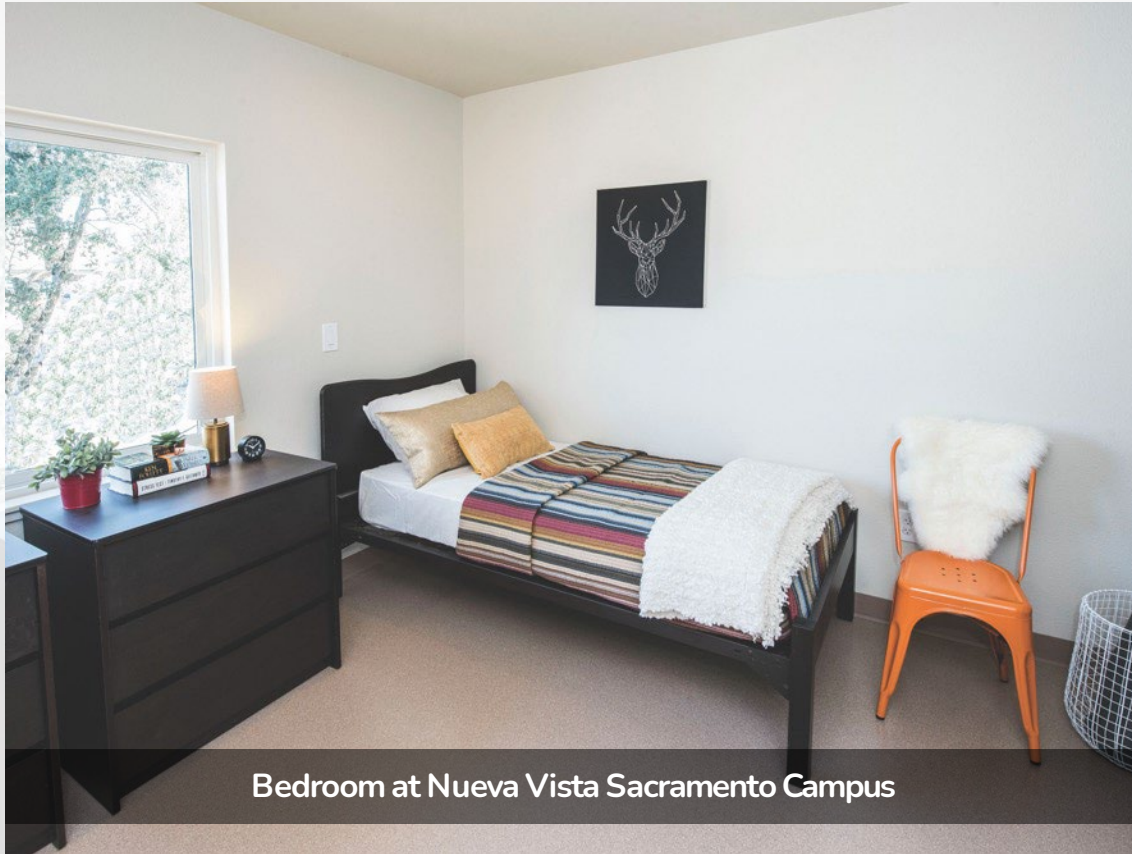
Bedroom at Nueva Vista Sacramento Campus